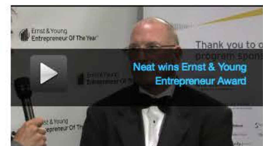
Neat wins Ernst & Young Entrepreneur Award